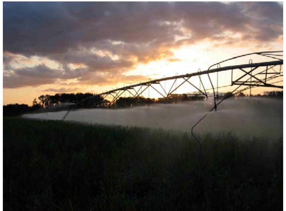
Low pressure irrigation system to conserve energy and water